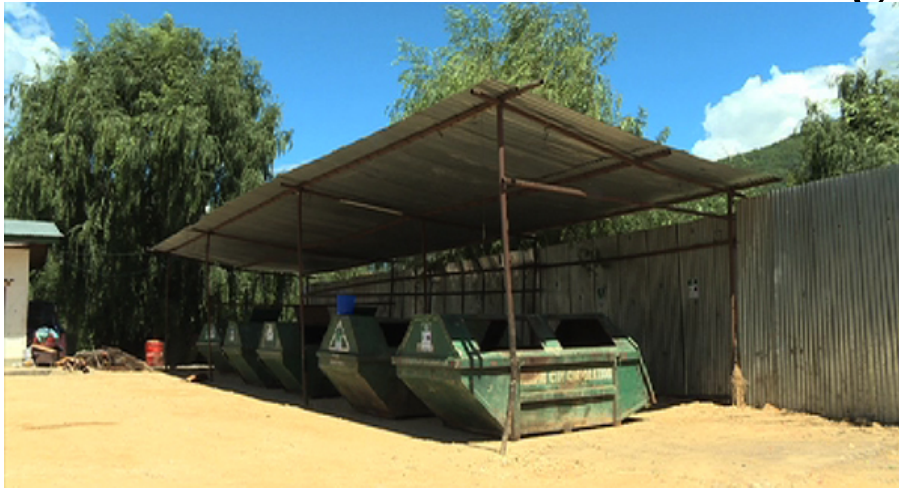
Waste Drop off-Center

❖ Also addressed in the National Waste Management Strategy, 2019