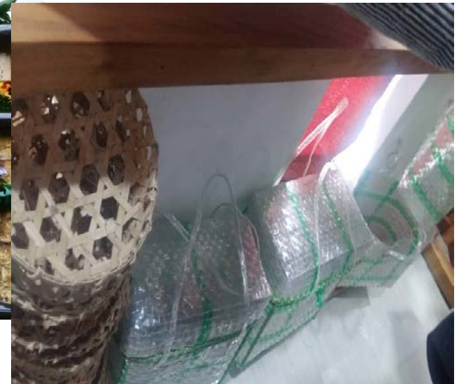
Bags out of plastic waste