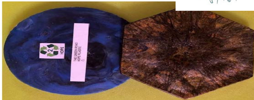
Saucer pieces from plastic waste