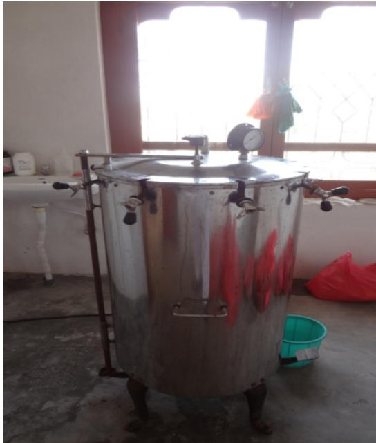
The old Vertical waste autoclave machine